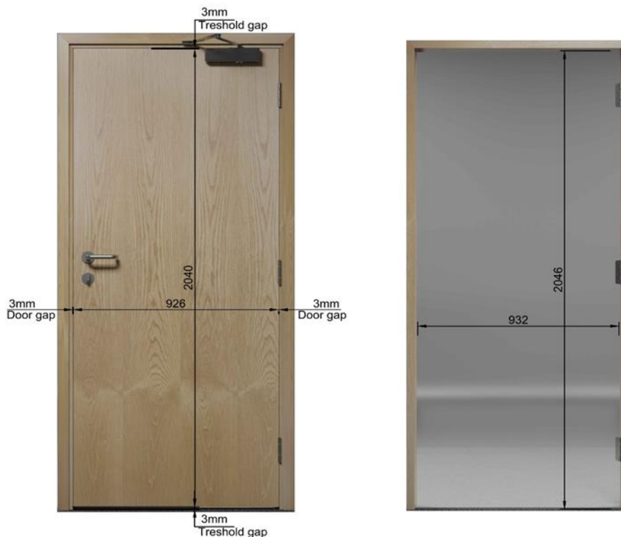
Figure 1: Dimensions of door and required door frame

Europe. Data would not be available on the installation of the door if the sizes in the EN17213 were reported on.