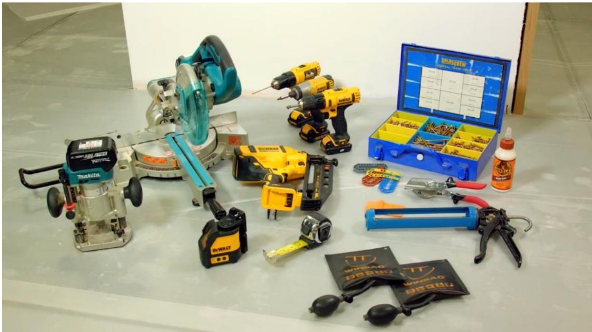
Figure 3: Section of tools required to fit a FD30 door.

To insure the correct installation of the door please follow the instruction at https://www.forza-doors.com/media/168306/forza_zs_door_installation_guide_fd30-60_pdf.pdf